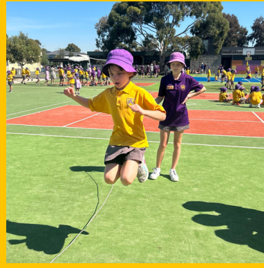
Whole School Skipping Morning