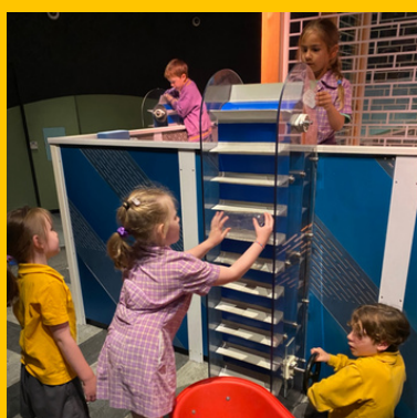
Grade Prep excursion to Scienceworks