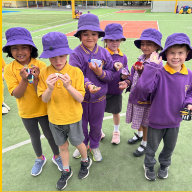
FFC Canteen Day