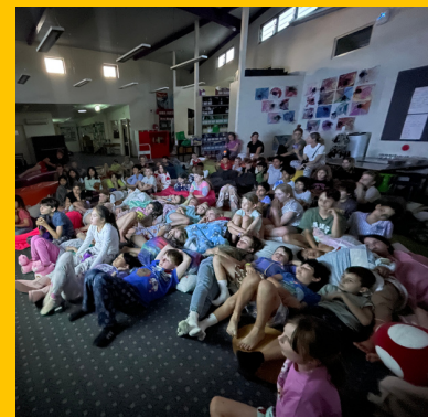
Grade 3 Sleepover