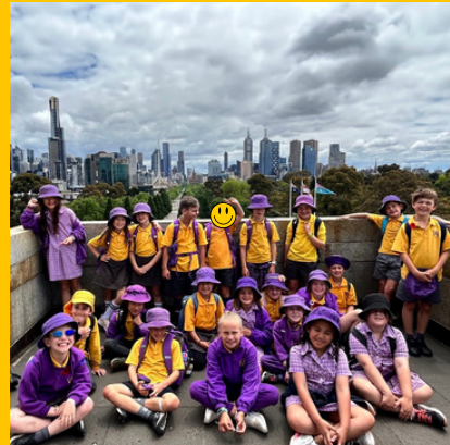
Grade 2 excursion to The Shrine