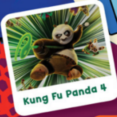
Kung Fu Panda 4