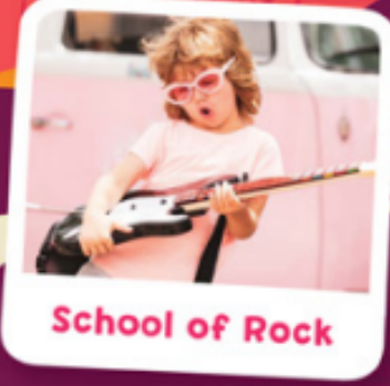
School of Rock