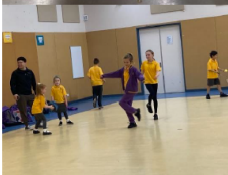
WEEK 9 ACTIVITES